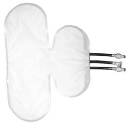
Wrap, Large Butterfly, SPU

Re-Order Part Number: 0P9BSSWHMR3 (Non-Sterile), 0P9BSSWHMR3-S (Sterile)