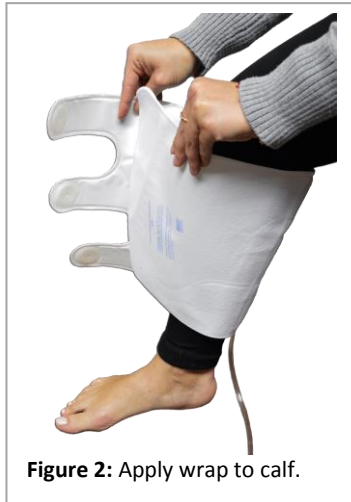
Figure 2: Apply wrap to calf.