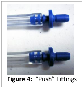
Figure 4: "Push" Fittings