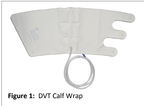
Figure 1: DVT Calf Wrap

Re-Order Part Number: 0P9BNDVTCA4 (Non-Sterile), 0P9BNDVTCA4-S (Sterile)