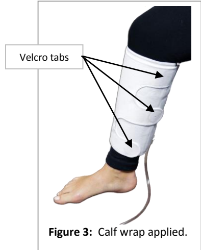
Figure 3: Calf wrap applied.