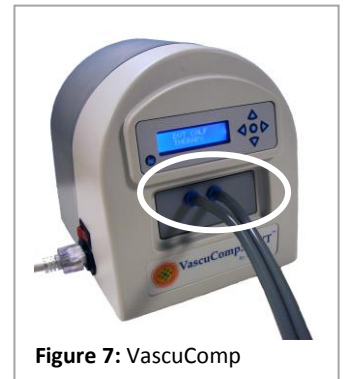
Figure 7: VascuComp

Install fittings to the unit: DVT Left and Right Ports